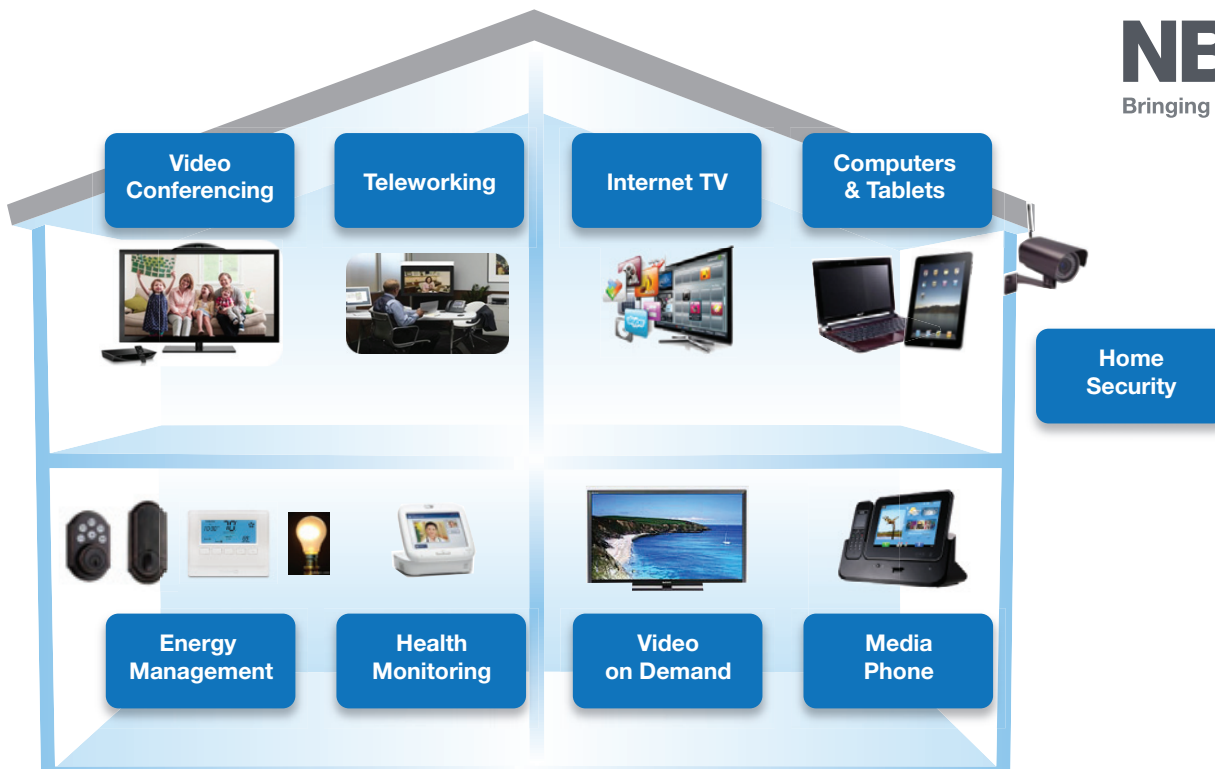
Figure 2 – Some of the potential applications and services that can be enabled by the NBN