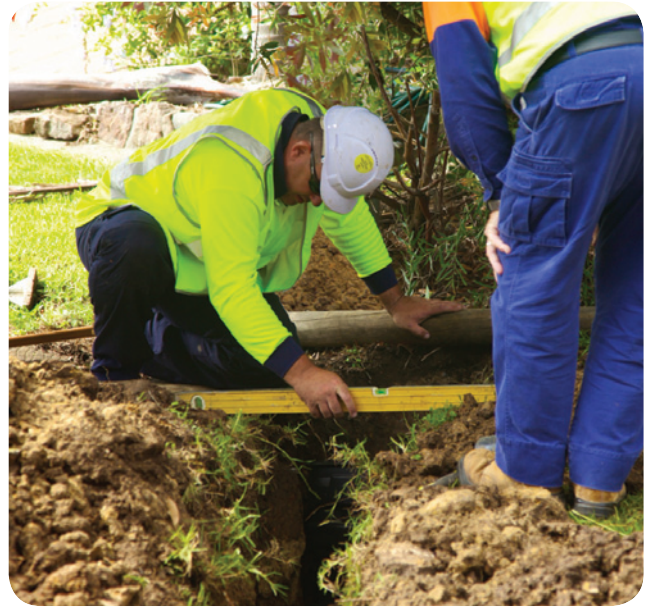
Developers are responsible for installing pit and pipe infrastructure to NBN Co specifications and standards.