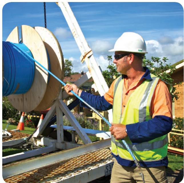
NBN Co or an NBN Co subcontractor will install fibre infrastructure to each premises in a new estate.