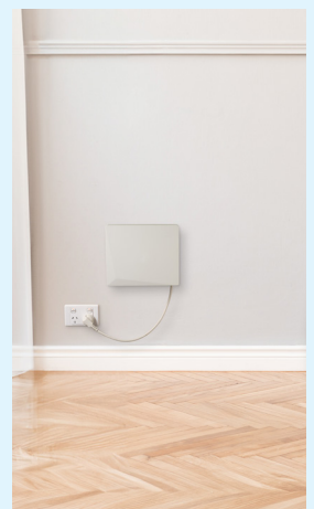
nbn connection box mounted on the inside surface of an external wall