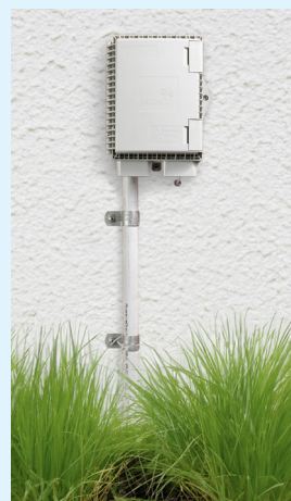
nbn utility box mounted on the surface of an external wall