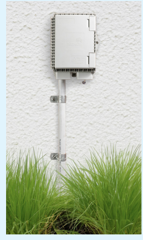
nbn utility box mounted on the surface of an external wall