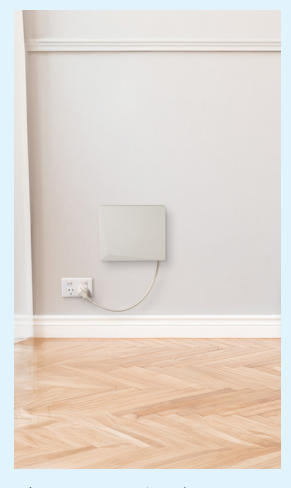
nbn connection box mounted on the inside surface of an external wall